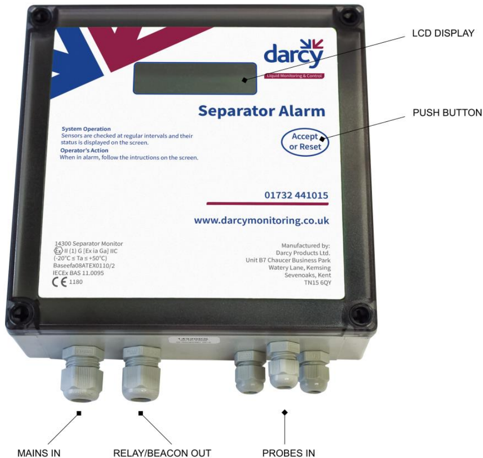
Figure 1 - Cable glands, LCD and push button positions

The standard system is supplied complete with an intrinsically safe control unit together with a high oil probe. The control unit is capable of monitoring up to 3 probe units, displaying their current status via a 2 x 16 display. The output relay enables this status to be signalled to a remote location or activate a beacon if required.